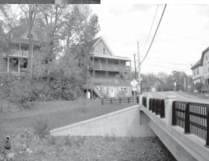
Bridge by Copeland Block