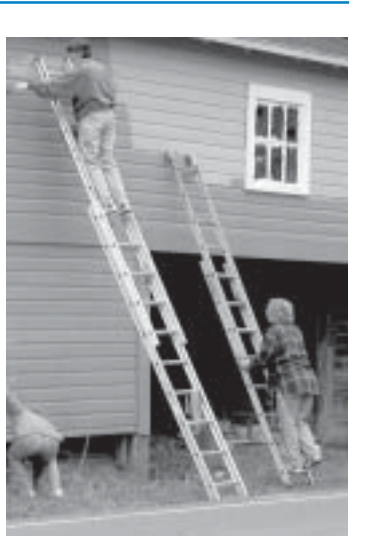
Hardworking EVA Volunteers