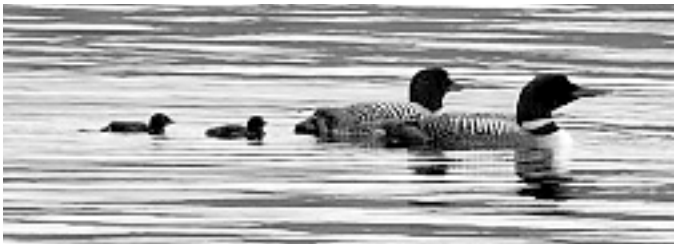
Loon family on Crystal Lake

YogaPiphany (see ad page 34) 502 US Route 4 ..... (603) 290-2900 yogapiphany@live.com www.yogapiphany.com