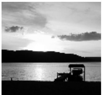
Sunset over Mascoma Lake.