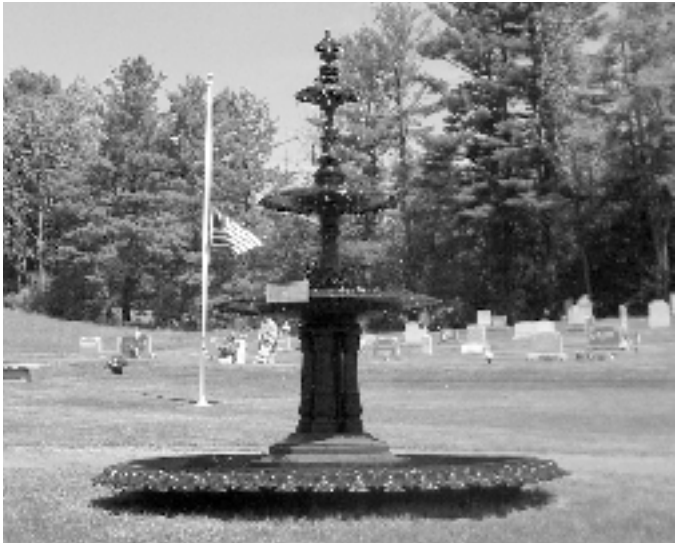
One of the newly-restored fountains in Oak Grove Cemetery.