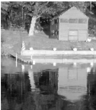
Boys' Camp Boathouse on Crystal Lake.