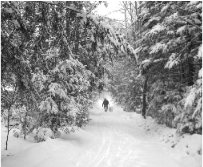
New Year's Day Along Dustin Road.